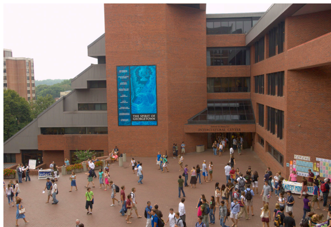
Bunn Intercultural Center (ICC)

Consultant, Georgetown Leadership Seminar, Institute for the Study of Diplomacy, School of Foreign Service, Georgetown University